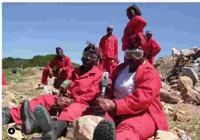
1-4: Harvesting and cutting stone