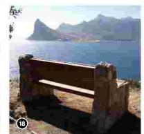
17-18: A stone bench on Chapman's Peak Drive