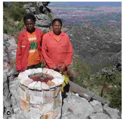
11-16: Construction of signage hubs