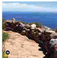
9-10: Directional signage and a stone wall