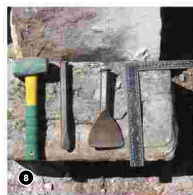
5-8: Tools of the trade